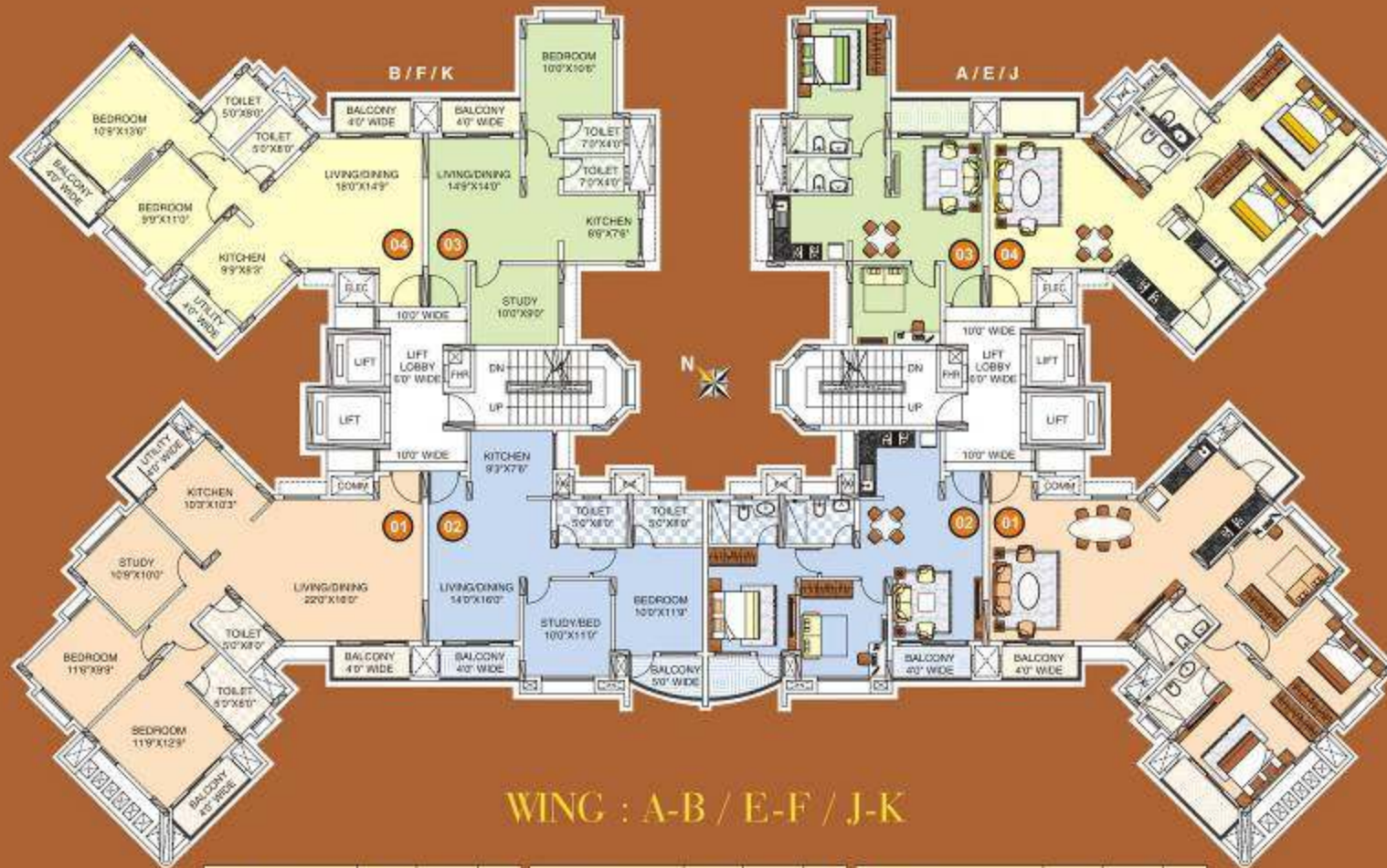
WING : A-B / E-F / J-K